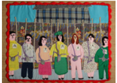
Figure 2. Encadenamiento / Women Chained to Parliament Gates. Chilean arpillera , Anonymous (c1988). Photograph Martin Melaugh, © Conflict Textiles. Conflict Textiles Collection: https://cain.ulster.ac.uk/conflicttextiles/search-quilts2/fulltextiles1/?id=222

2017). Marjorie Agosín argues that arpilleras are anything but 'an innocent art' but rather 'an art denouncing' through a 'cloth of resistance' (Agosín, 2008, p.55). Likewise, others have spoken of the textiles as the production of the 'denunciatory' (Adams, 2000). In an exhibition at the Victoria and Albert (V&A) museum in 2014–2015, the arpilleras displayed, loaned by Conflict Textiles (discussed below), were described as 'disobedient objects' (Compton, 2014; Conflict Textiles, 2014) (see Figure 2, featuring women chaining themselves to the Parliament Gates in protest).