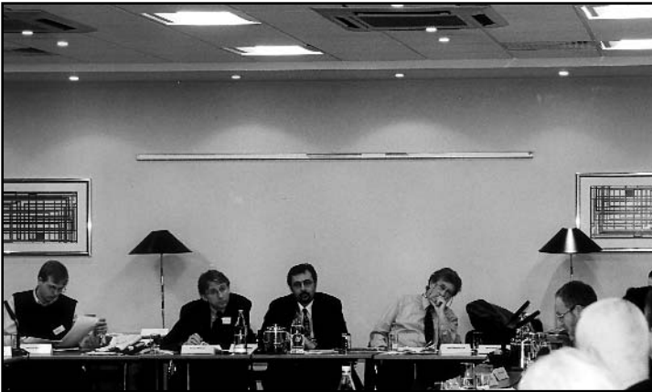
Fruitful exchanges—the 20 round table

In April 2002—following some 121 public and organisational responses—the Office of the First Minister and Deputy First Minister launched its victims strategy document, Reshape, Rebuild, Achieve (OFMDFM, 2002). The strategy, which is to run until April