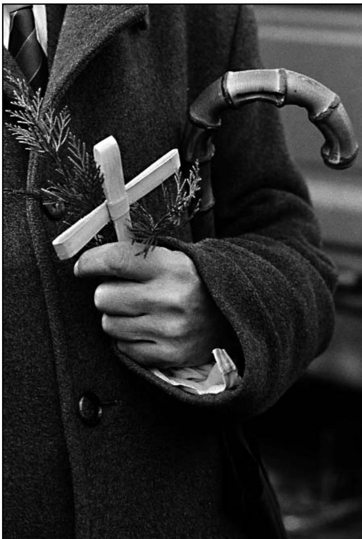
Reconciliation is the hardest part

responsibilities of the wider community. These include providing circumstances, conditions and supports to